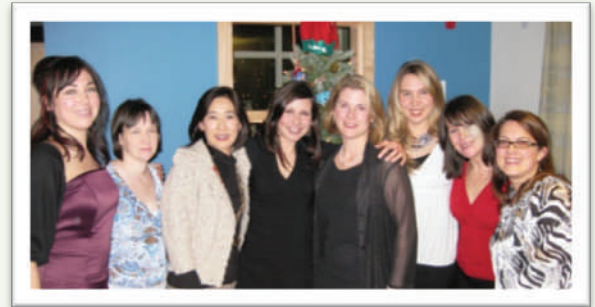
Rotary Home Nursing Team

The longer I have the privilege of working at the Ottawa Rotary Home, the more deeply I am convinced that the clients and families that we support are heroes. The amount of love and care that are poured into often unbelievably busy schedules is amazing and beautiful. Obstacles are faced with grace and optimism. Parents become experts in the art and science of the care of their children and young adults, and bring a wealth of knowledge to us. What a testament to the human spirit.